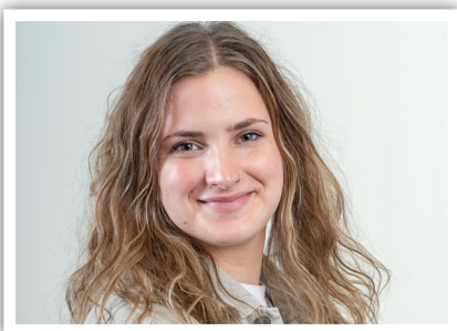
Miss Cox Room - BG19