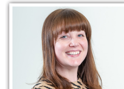
Miss TAYLOR Room - W205