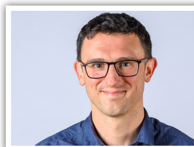
Mr GRIFFITHS Room - BG43